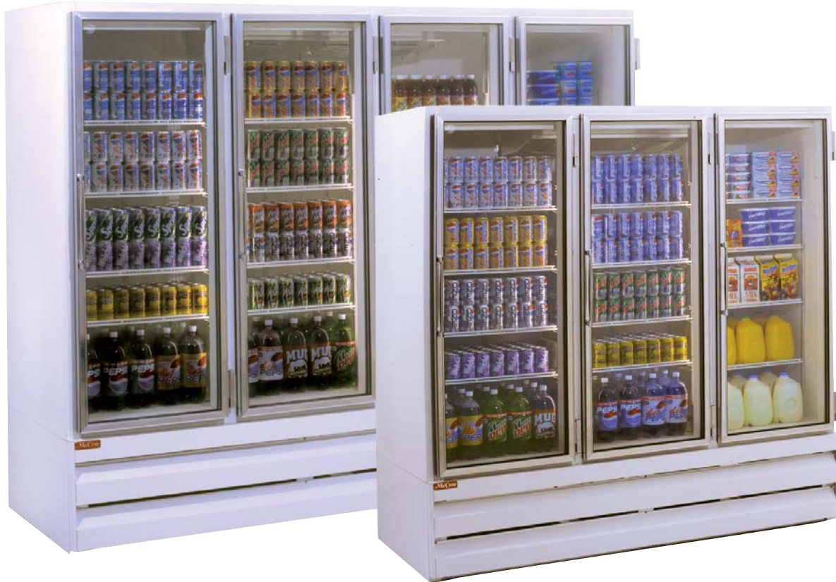
Shown with hinged glass doors